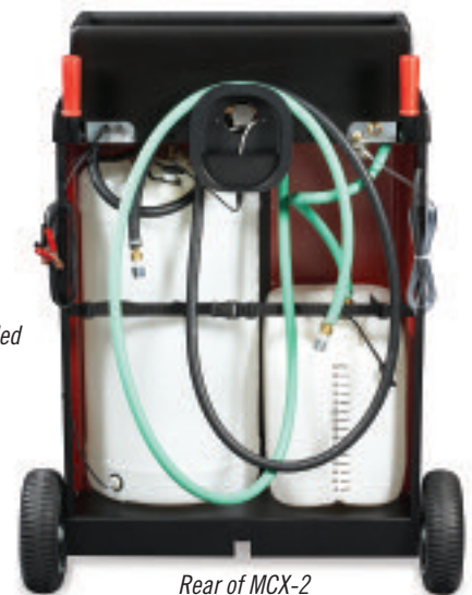
Rear of MCX-2